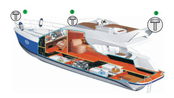
Figure 1 - Mounting Location